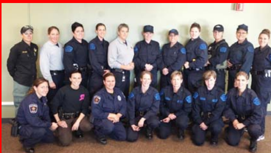
Michigan State Police

Thank you for your support and the opportunity to train America's finest!