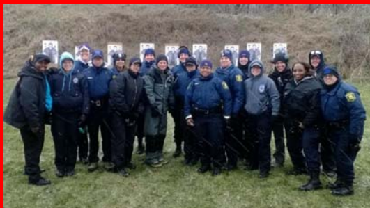
Polk County Sheriff's Office