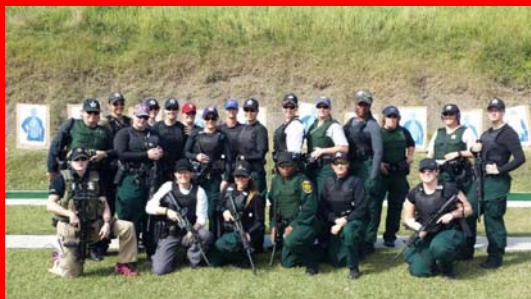
Pierre, South Dakota