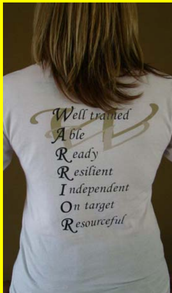
Warrior Women® T-Shirt Order yours While they last...